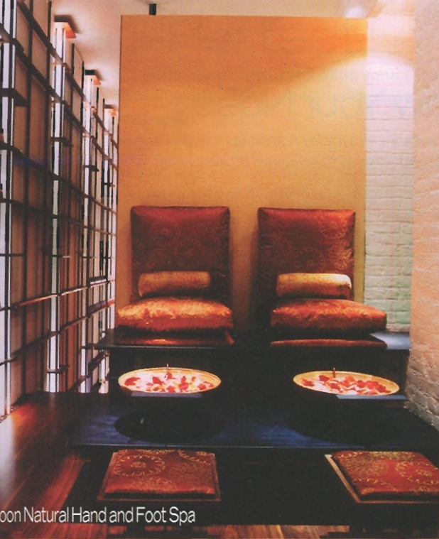
Jin Soon Natural Hand and Foot Spa